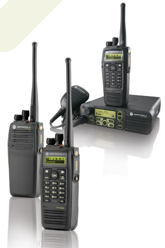
Motorola MOTOTRBO XPR Digital Radios