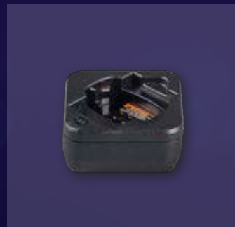
PMPN4587 SINGLE-UNIT CHARGER