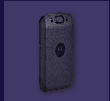
HKNN4013ASP01 BT90 STANDARD CAPACITY BATTERY