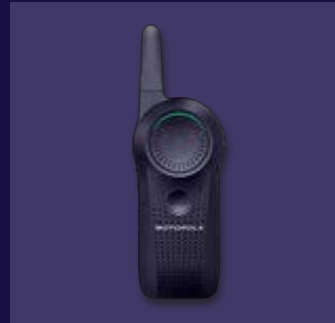
PMUF1983 CURVE RADIO