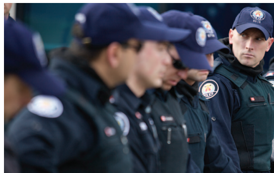
Assessing the stress levels of recruits during training