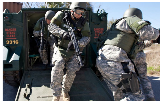
Speeding secure voice communications to a SWAT team