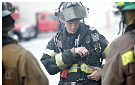
Monitoring firefighters' vital signs in a burning building