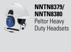
NNTN8379/ NNTN8380 Peltor Heavy Duty Headsets