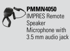
PMMN4050 IMPRES Remote Speaker Microphone with 3.5 mm audio jack