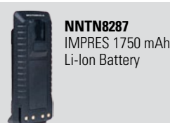
NNTN8287 IMPRES 1750 mAh Li-Ion Battery