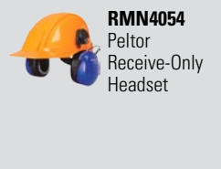
RMN4054 Peltor Receive-Only Headset