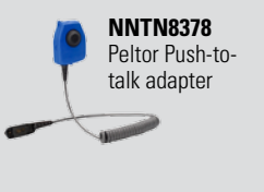
NNTN8378 Peltor Push-to- talk adapter