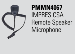
PMMN4067 IMPRES CSA Remote Speaker Microphone