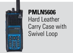
PMLN5606 Hard Leather Carry Case with Swivel Loop

For more information on how to connect with greater confidence and work with greater safety, visit motorolasolutions.com/mototrbo