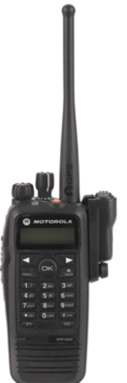
XPR 6000 SERIES with PMLN5993 (Bluetooth Touch Pairing Adapter)