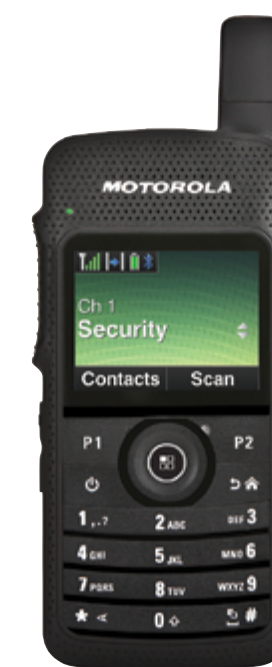
SL 7500 SERIES