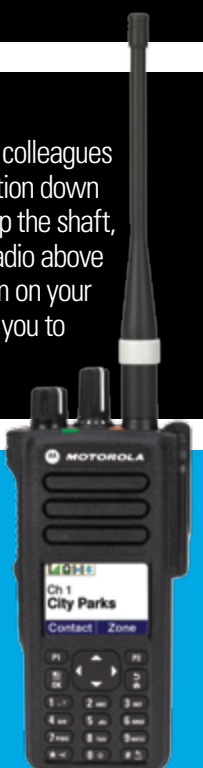
XPR 7000 SERIES

Connect your MOTOTRBO XPR 7550 portable radio with integrated Bluetooth to an intrinsically safe Operations Critical Wireless earpiece and you'll never be out of range underground again.