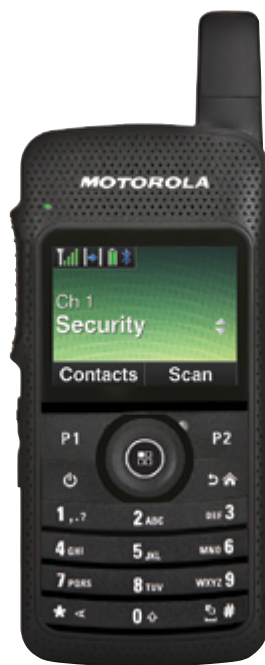
SL 7500 SERIES