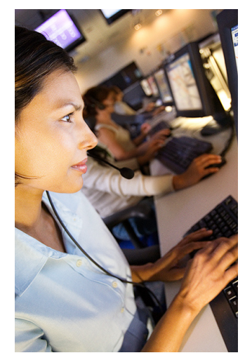
With MOTOTRBO's integrated GPS capability, dispatchers can track employees and vehicles in order to coordinate your fleet in the most efficient manner possible.