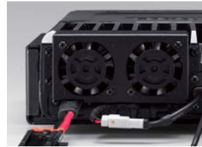
Optional CFU-F8100 fitted to the rear panel.