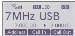
Function button menus are shown at the bottom of the display

The following functions can be assigned to the [I], [II], and [III] soft key buttons: Main menu, Manager menu, Set mode, Selcall address list, RX history, and TX history.