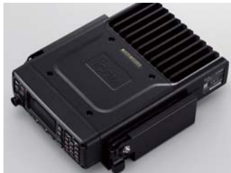
IC-F8101 with optional MB-126.

The IC-F8101 has a durable, enclosed structure securely sealed from the elements, in a stealthy black compact package. The IC-F8101