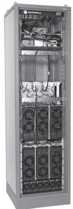
GTR 8000 Expandable Site Subsystem

Designed to carry your needs into the future, the G-series hardware platform has built-in functionality and flexibility with an AC/DC - 48VDC power supply and two-branch receive diversity capacity, as well as a linear power amplifier for improved coverage in P25 FDMA Simulcast systems.