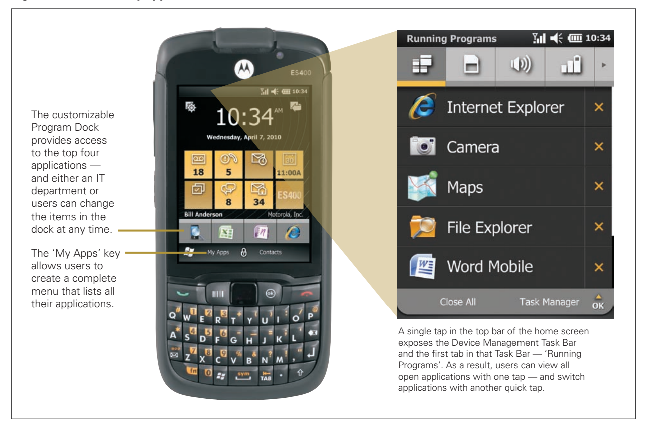
Figure 6: Fast and easy application access

Rich business intelligence can be appended to photos, including: voice and text comments; numbered annotation markers that can be placed on photos to enable detailed references; a file name; and a geostamp that indicates time, date and location where the photograph was taken.