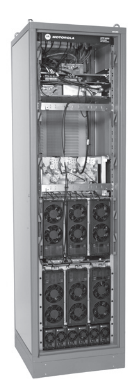
GTR 8000 Expandable Site Subsystem

Designed to carry your needs into the future, the G-series hardware platform has built-in functionality and flexibility with an AC/DC - 48VDC power supply and two-branch receive diversity capacity, as well as a linear power amplifier for improved coverage in P25 FDMA Simulcast systems.