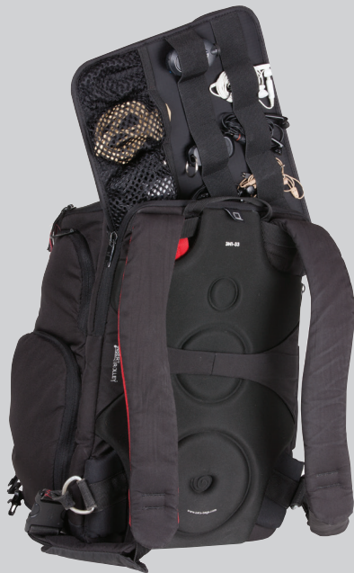
Note: Backpack not included with case