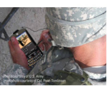
Extend the security and functionality of the network to the battle field with secure data access and real-time data applications, such as geographic information system (GIS) mapping, video and remote medical monitoring.