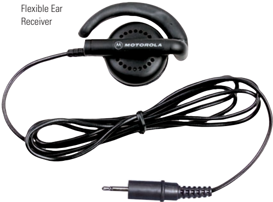
BDN6719A Flexible Ear Receiver

Simply remove the earpiece from any standard 2 or 3-Wire Motorola Surveillance Kit and plug in the neckloop, which is easily hidden under clothing. Security personnel will be able to wear this tiny receiver comfortably for hours at a time!