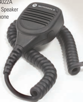
PMMN4022A Remote Speaker Microphone