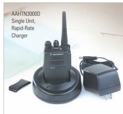
AAHTN3000D Single Unit, Rapid-Rate Charger

RL-77255 Standard Adapter for BOS II. For Li-ion batteries.