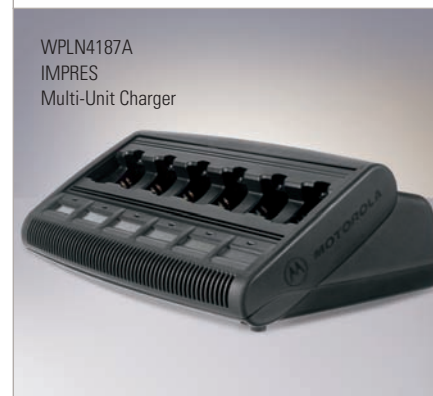
WPLN4187A IMPRES Multi-Unit Charger