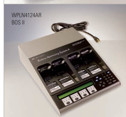
WPLN4124AR BOS II