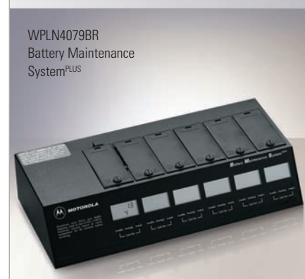
WPLN4079BR Battery Maintenance System PLUS