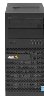
AXIS S9001 Desktop Terminal sold separately