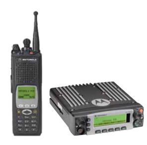
Noise Shield is available on all XTS/XTI 5000, 2500 and 1500 portables and mobiles.

At best, background noise is a nuisance. At worst, it's a hazard that can impede communication and threaten first responder safety. That's why Noise Shield 2, Motorola's advanced noise reduction software with PASS (Personal Alert Safety System) Intercept, is vital to reducing the impact of ambient noise during radio transmissions. A PASS device, worn by firefighters, sounds a loud audible alert to notify others in the area that the firefighter is in a possible distress situation due to lack of movement.